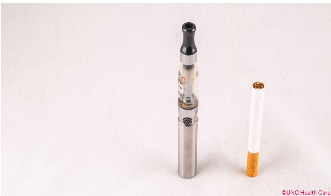
A second generation ENDS next to a traditional cigarette

In 2021, the Scientific Committee on Health, Environmental and Emerging Risks (SCHEER), on request by the EU Commission, reviewed the most recent scientific and technical information on e-cigarettes. 16 They stated that while there is some evidence that e-cigarettes help smokers to stop smoking compared with placebo e-cigarettes (nicotine free), these studies tended to be methodologically weak. Thus, in regard to the role of e-cigarettes used as cessation measure of conventional tobacco smoking, SCHEER concluded that, given the scarcity and low quality of scientific evidence, there is only weak evidence for the support of e-cigarette effectiveness in helping smokers quit. 16 Similarly, the recent 2020 Surgeon General’s report on Smoking Cessation stated that, “The evidence is inadequate to infer that electronic cigarettes, in general, increase smoking cessation.” 19