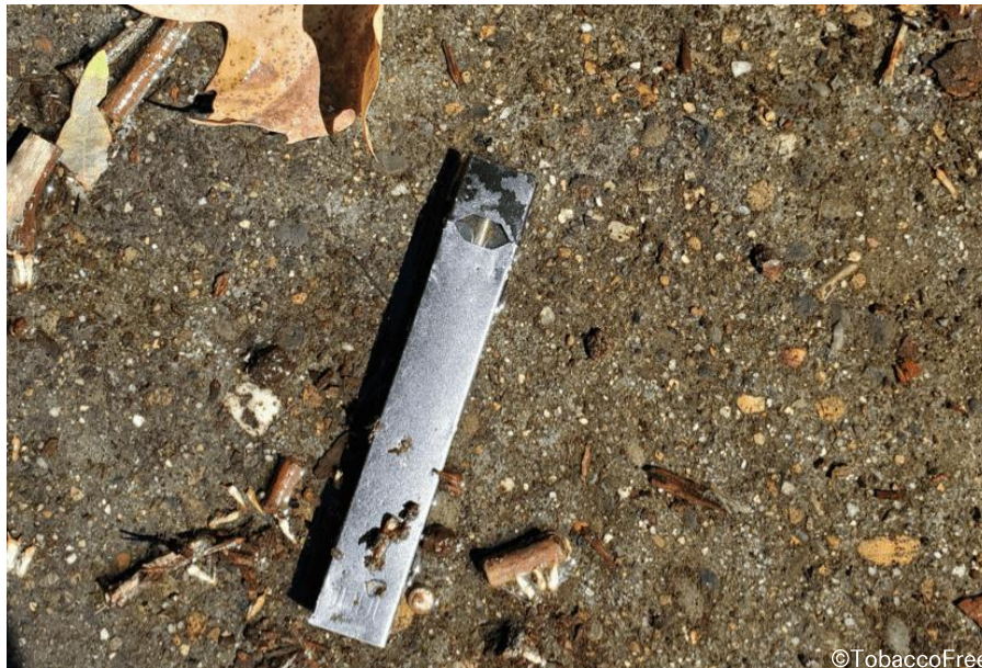
ENDS, like fourth generation Juuls, are often not be disposed of correctly.

Because e-cigarettes contain toxic chemicals, heavy metals, and residual nicotine, their waste is a serious threat to our water, air, and land. In short, vape trash isn't just litter, it's toxic waste. E-cigarette waste cannot biodegrade even under severe conditions. Cartridges and pods discarded on streets mix with leaf litter and get pushed around by weather events, eventually breaking down into microplastics and chemicals that flow into storm drains to pollute waterways and endanger wildlife. Some vapes can even leak heavy metals and residual nicotine into the environment. 1 Moreover, the mining and manufacturing of materials for ENDS, and the disposal of ENDS can be harmful to the environment. 56 Particularly single use, disposable e-cigarettes like Puff Bars pose the biggest threat to the environment, because as the name suggests, they are used only once, and then discarded with their plastic exterior, and lithium-ion battery, which is made of lithium, cobalt, and nickel. Moreover, other than their batteries and plastics, they typically contain metal coils and harmful chemicals with heavy metals like lead, as well as nicotine leaking out and posing a biohazard risk. In consideration of the major raw materials required to make various ENDS, the production chain of these devices has a destructive impact on ecosystems and communities, as the raw materials needed are acquired through unsustainable mining. 57