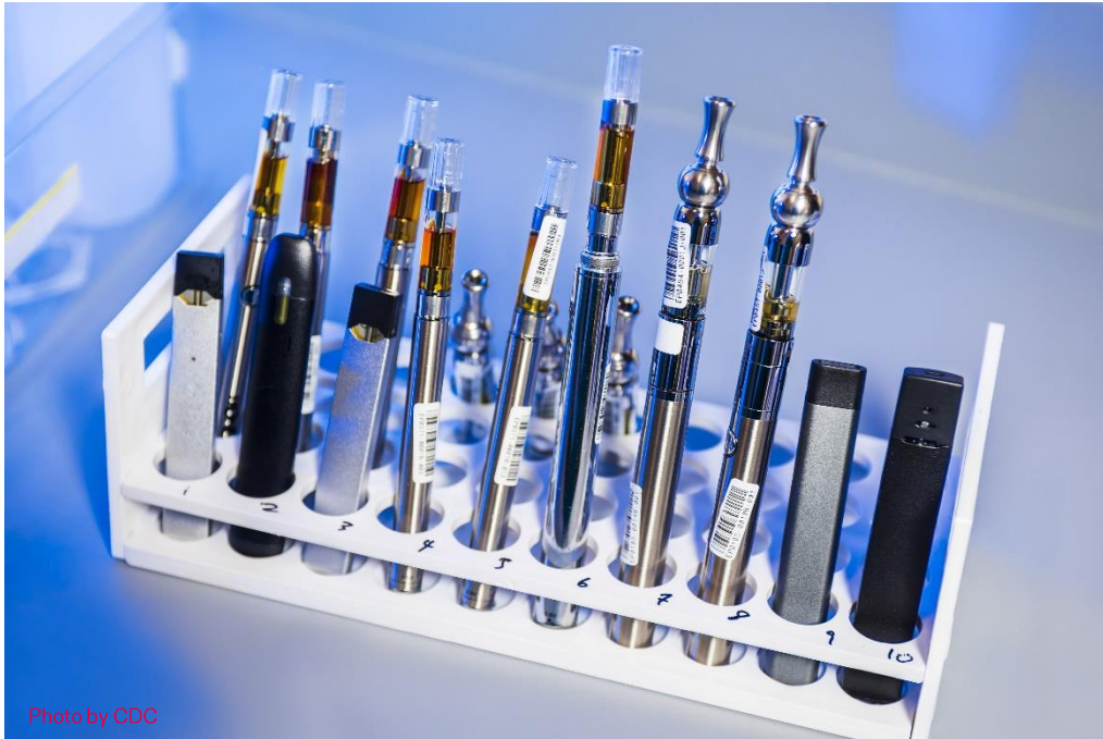
A test tube rack with examples of different e-cigarettes.